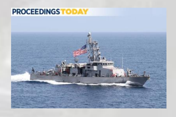
U.S. Navy Corvette

Pretty shocking isn't it? The car named after the U.S. Navy's fastest and sleekest warship in World War II, nearly sank on dry land in 1955 due to poor sales. The American auto industry as we know it would look entirely different today without America's purest sports cars.