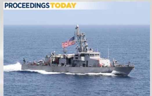
U.S. Navy Corvette

Pretty shocking isn't it? The car named after the U.S. Navy's fastest and sleekest warship in World War II, nearly sank on dry land in 1955 due to poor sales. The American auto industry as we know it would look entirely different today without America's purest sports cars.